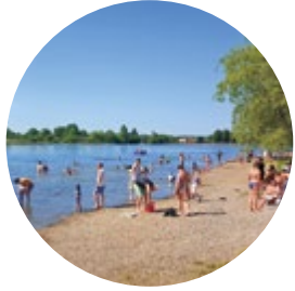
Swimming in the lake at MITTERSHEIM