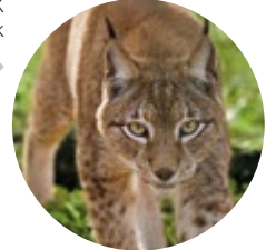
DOMAINE SAINTE-CROIX Animal park