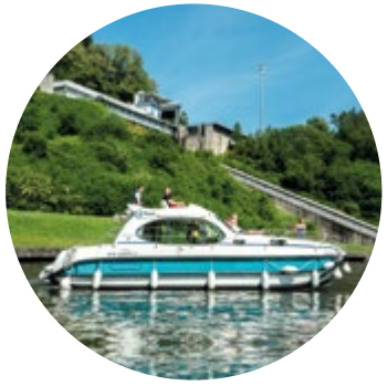
ARZVILLER Inclined plane