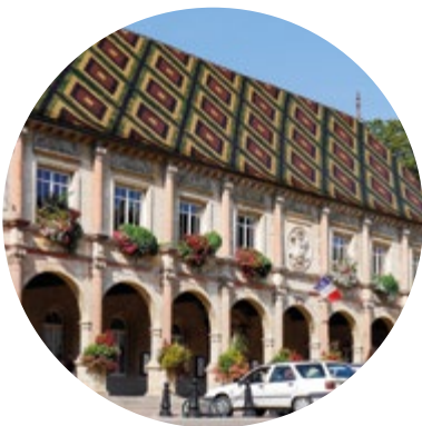
→ GRAY Polychrome roofs