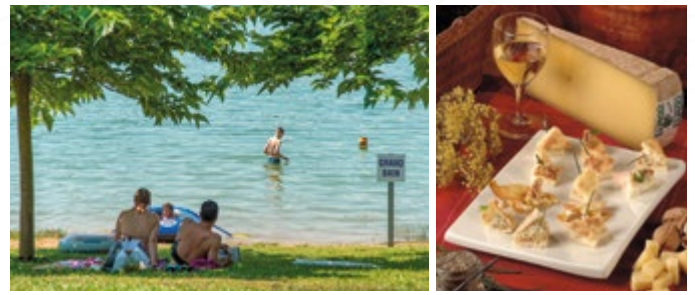
→ Swimming from the banks of the Saône river