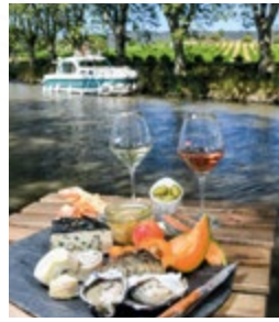
→ CANAL DU MIDI