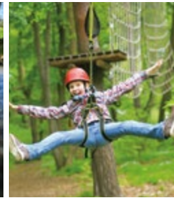
→ PORTIRAGNES Adventure parks