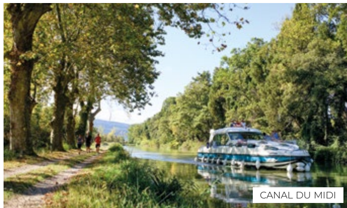
CANAL DU MIDI