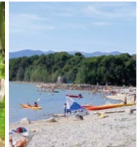
→ HOMPS Jouarres lake